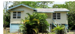
The 'new' hall is built on the old tennis court site, was opened in 1996