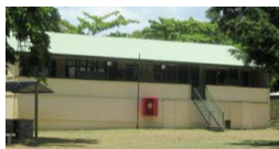
☛ The SES Hall was the schoolhouse

Yorkeys Knob Community Centre at the corner of Wattle Street and Cunningham Streets was the site of the old Yorkeys Knob School before the present school opened in 1980. Once the new school was built the area was handed over to the Mulgrave Shire Council by the Queensland Government, Mulgrave and Cairns Council merged in 1990s. The pleasant grounds at the community centre were the old schools playground. The magnificent Pine trees were the result of a Project Club, popular at the time.