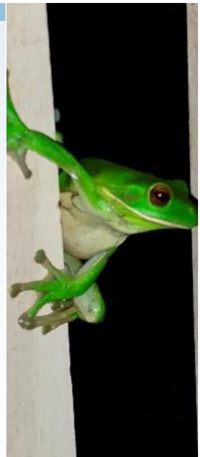
White lipped green tree frogs are a familiar sight in our neighbourhood