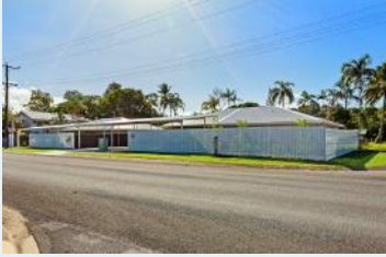
Premises on Rutherford Street