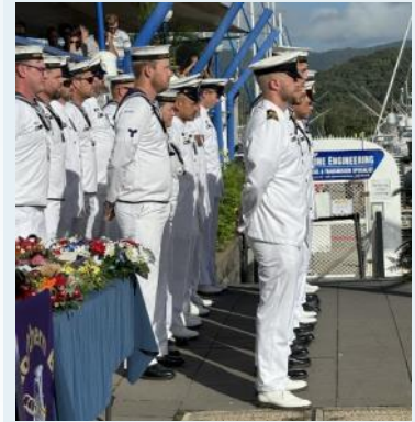
ANZAC Day 2024 Yorkeys Knob Boating Club