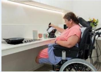
Specialist Disability Design