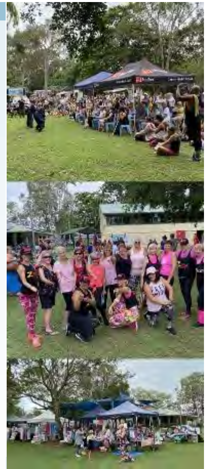
Snapshot of the Festival