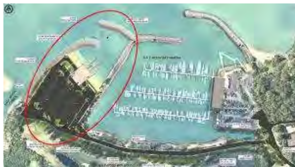
Image depicting the proposed boat ramp with harbour and access road