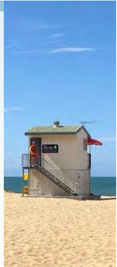
Lifeguard Hut at Yorkeys Knob beach