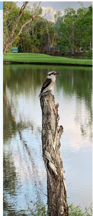
Kookaburra at Half Moon Bay Golf Club